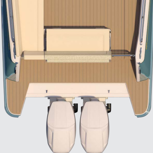
TWIN MERCURY 600 HP OUTBOARDS