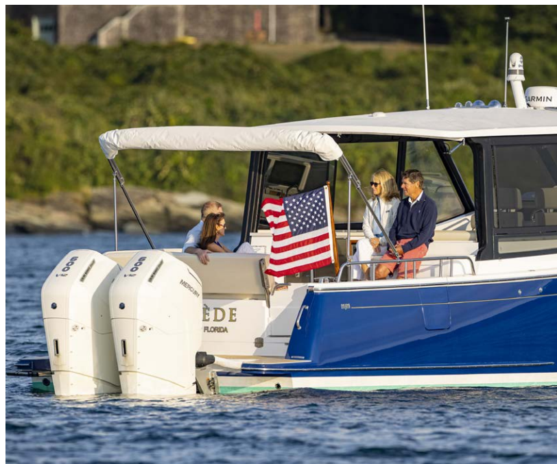
Convertible double sunlounge aft