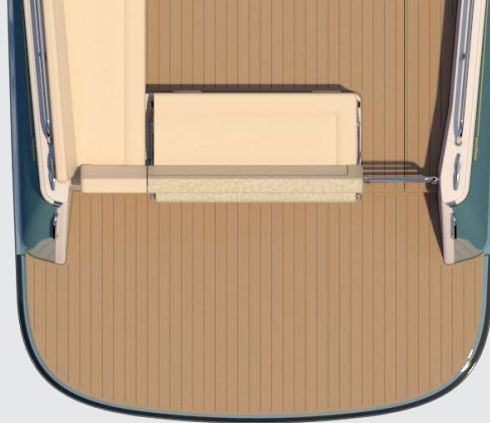
TWIN 440 HP DIESEL STERNDRIIVE