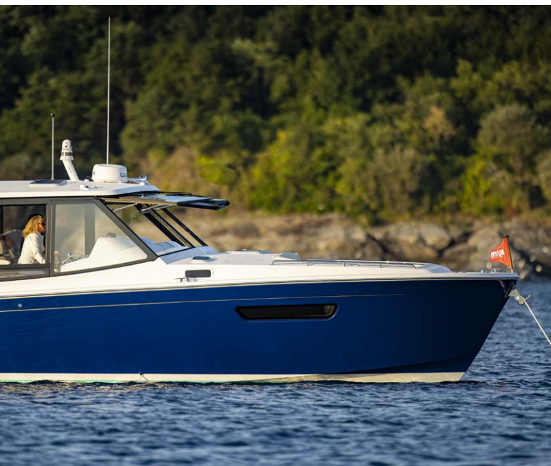
Opening electric windshields

Enjoy the spacious and secure comfort of the bow area while chatting with friends. The all-weather, all-conditions, indoor-outdoor pilothouse has all the amenities for day yachting. The galley-up design puts it right in the middle of all the action.