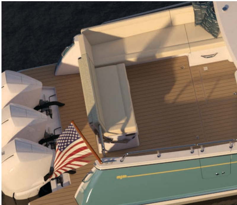
Convertible double sunlounge aft