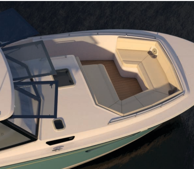
Opening electric windshields

Enjoy the spacious and secure comfort of the bow area while chatting with friends. The all-weather, all-conditions, indoor-outdoor pilothouse has all the amenities for day yachting. The galley-up design puts it right in the middle of all the action.