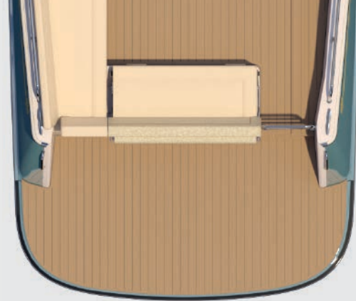
Available 2024 TWIN 440 HP VOLVO DPI