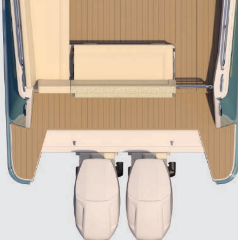
TWIN 600 HP VERADOS