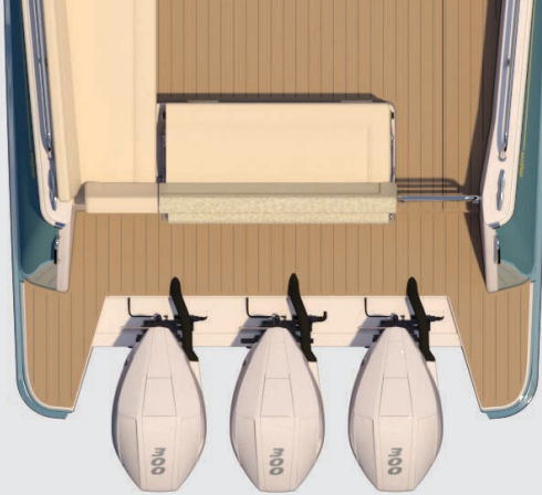
TRIPLE 300 HP VERADOS