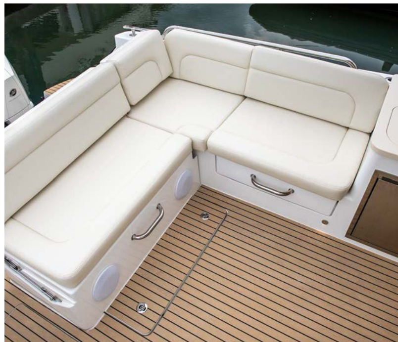
Convertible double sunlounge aft