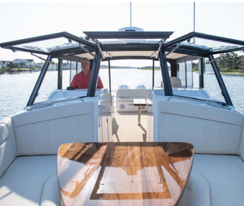
Opening electric windshields

Forward, a comfortable bow features a full sun cushioned area with additional storage below. The pilothouse provides a protected space where the captain and friends can close the generous windows and enjoy climate-control. The cockpit is a hub for entertaining with an optional grill, refrigerator, ice maker, or sink.